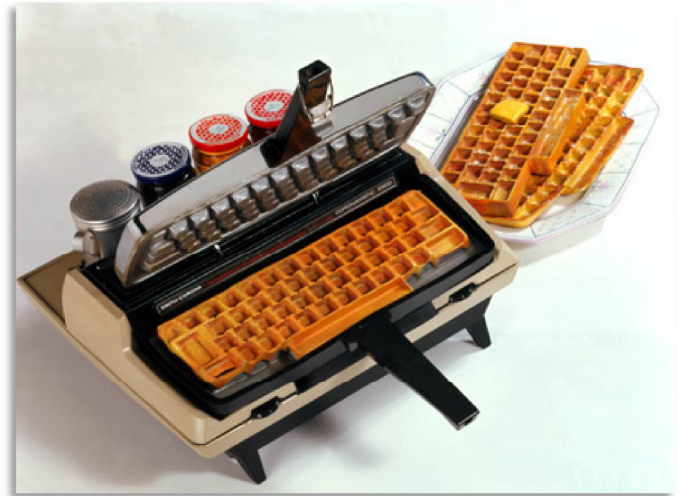
Anybody want a QWERTY Waffle?